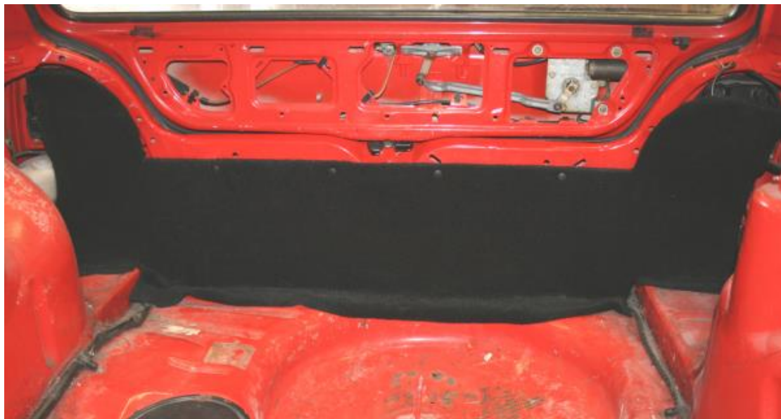
Where the carpet fits in the boot